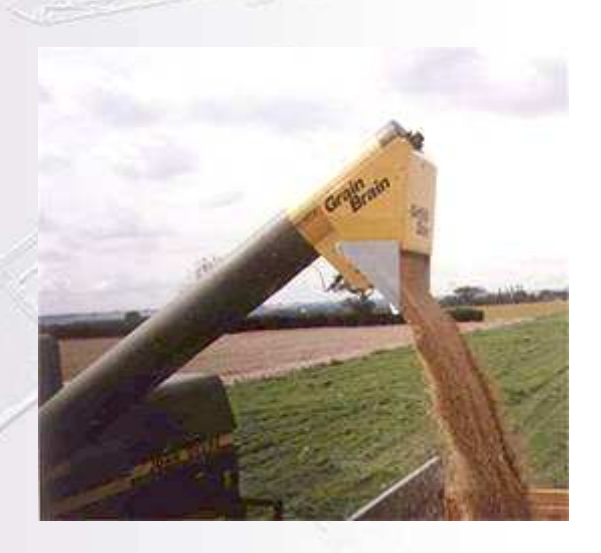
Griffith Elder and Company Ltd 1 Oaklands Park Bury St Edmunds Suffolk IP33 2RW United Kingdom

Telephone: +44 1284 719619 Fax: +44 1284 700822